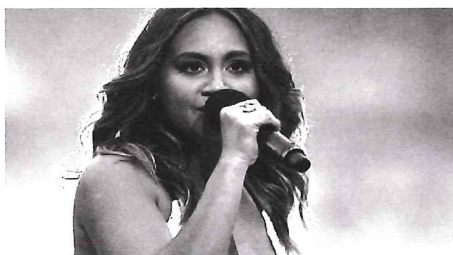
Jessica Mauboy Indigenous Recording Artist