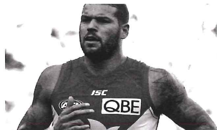
Lance Franklin Indigenous AFL Player