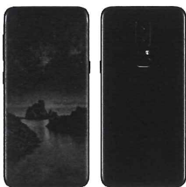
SAMSUNG GALAXY MOBILE PHONE