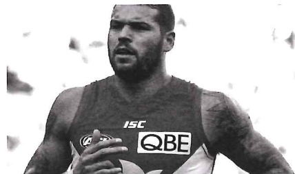
Lance Franklin Indigenous AFL Player