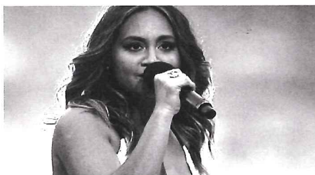
Jessica Mauboy Indigenous Recording Artist