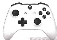
XBOX ONE S AND GAMES