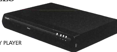
BLU RAY PLAYER