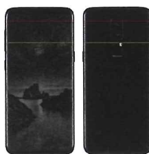
SAMSUNG GALAXY MOBILE PHONE